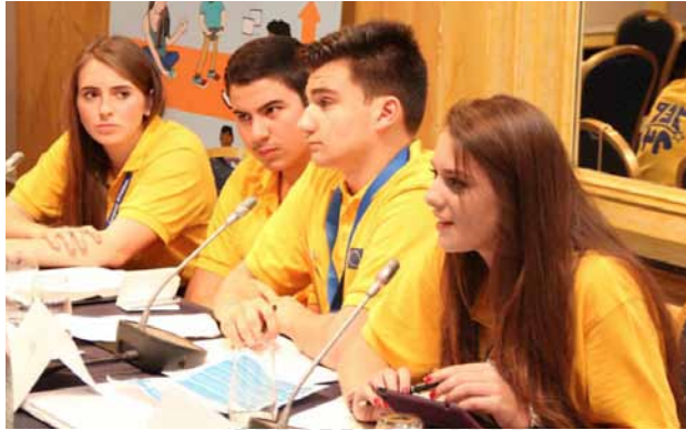
Two sessions at the Safer Internet Forum 2014 were hosted by youth panellists as they led the discussions about online self expression

One of the highlights of this year's SIF was the youth-led session on self-expression and online reputation where all young people had the opportunity to take the floor and express their viewpoint throughout the two events. Young people were very active in the sessions with senior industry leaders and policy makers and were confident in asking questions and providing food for thought to these parties.