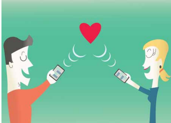
The 2014 Insafe Good Practice Guide addressed the issue of online relationships

2014 has also seen a big focus on educational resources on online safety issues. Following a successful resource competition and exhibition which took place at the Insafe network training meeting in Vilnius (see section on Training meetings below), a number of network-produced resource were selected for translation and subsequently shared and disseminated across all network countries.