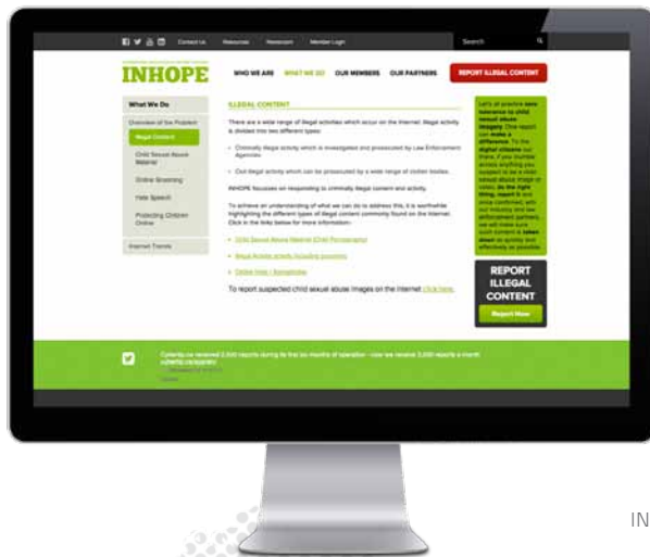
INHOPE's online platform

Representatives of each network attend all events organised by the other network.