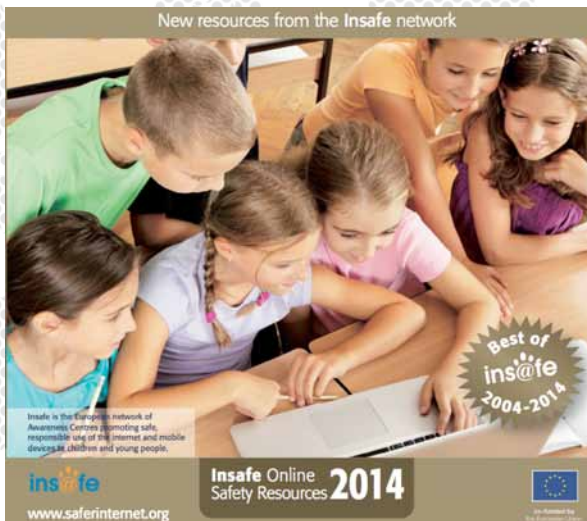
The 2014 edition of the Insafe Digipack of educational resources

Equally, the annual Insafe Digipack brings together the best eSafety resources from around the EU. The resource, produced in DVD format contains videos, handbooks, lesson plans and games as well as posters, comics and reading books which can be used in the classroom. It is primarily aimed at teachers and offers the highest quality new resources for helping children and young people of all ages to develop the necessary skills and competencies to understand how to use the internet and online technologies safely. A special edition of the Digipack was produced for 2014, comprising the best resources of the last 10 years from across the Insafe network.