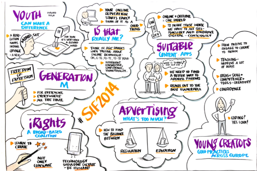
A graphic recorder summarised discussions from Safer Internet Forum 2014 in a visually appealing way.

For the first time at SIF, the discussions were followed by a graphic recorder – the result proved that more than ever in the digital age ‘an image is worth more than a thousand words’.