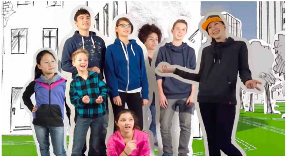
Safer Internet Day 2014 video spot: Let's create a better internet together