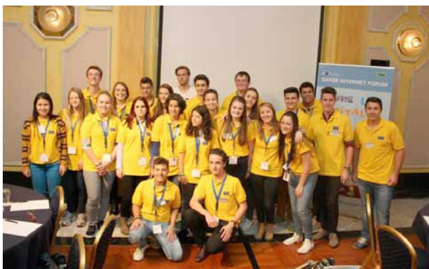
The Pan-EU Youth Panellists at Safer Internet Forum 2014

In November 2014, 25 youth representatives from 21 of the 31 network countries travelled to Brussels to participate in the Pan-European Youth Panel in the two days preceding the Safer Internet Forum. Young people worked together with two adult facilitators who are Youth Participation Coordinators in the Maltese SIC and Irish SIC respectively. Two youth moderators who are also Insafe Youth Ambassadors offered support and acted as a link between the moderators and the young people. During the preparatory Pan-EU Youth Panel sessions, four key areas were covered, mirroring the programme for the SIF, as follows: 'Young people as creators of online positive content', 'Growing up digitally and building your online reputation', 'Guidelines for positive content' and 'Youth Manifesto'. Pan-EU Youth panellists' feedback on their experience was very positive with a lot of friendships being made and contacts being established. The ideas exchanged and the exposure to the overall discussions on growing up digitally gave young people an important toolkit of information to be shared with their schoolmates and friends.