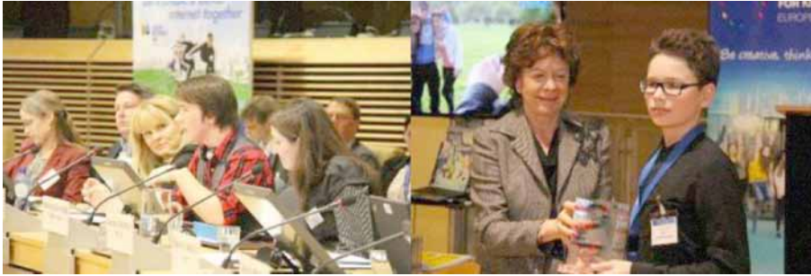
Young people addressed a high-level meeting of industry in Brussels (left), while winners of the European Award for Best Content for Kids received their awards from Commissioner Neelie Kroes (right).

Two high-level events took place on the day of SID at the European Commission, in Brussels: young people aged 12 to 17 years met with policy-makers, industry and academic experts while winners of the European Award for Best Content for Kids received their awards from Commissioner Neelie Kroes. The young people met Commissioner Kroes in her office prior to these events to launch the Youth Manifesto initiative (see Youth participation section below).