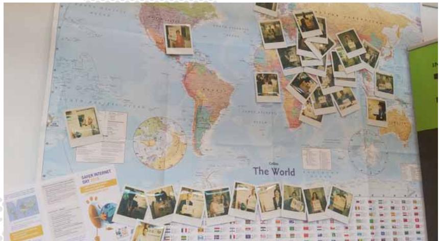
Polaroid campaign at Internet Governance Forum 2014

Members of the Insafe and INHOPE Coordination Teams were also in attendance to promote the wider work of the two networks, establishing many new contacts with the global online safety community from countries as diverse as Afghanistan and Ukraine, to Colombia and Paraguay. A booth in the IGF village attracted much attention, with a selection of Insafe resources and an INHOPE infographic being in high demand while a Polaroid campaign, using a mix of old and new technology, proved to be a huge success.